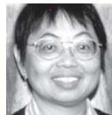
The Honorable Frances Q.R. Wong, Senior Judge of the First Circuit Family Court